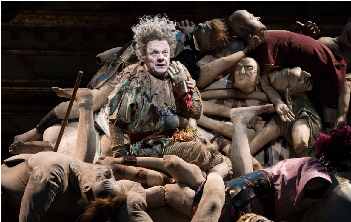
Nathan Lane in Gary: A Sequel to Titus Andronicus by Taylor Mac.

In many theatres, resident playwrights became advocates, coaches, and supports for other playwrights during productions of their plays. This was particularly valuable when the non-resident playwright was a person of color whose work was being produced by white-led theatres, where racial and institutional power dynamics were both at play.